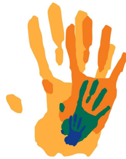
National Consumer Advisory Board