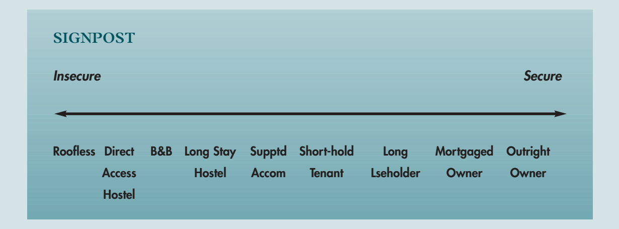
Figure 1 Where to Draw the Line? Accommodation Situations along the Home-To-Homelessness Continuum

Where to draw the line between the situations recognised as homelessness and those not must be determined in consultation with agencies involved in and supporting the count. Different agencies employ very different definitions of homelessness. The local authority homeless person units, for example, will employ a very restrictive definition, reflecting the groups they have a statutory responsibility to assist under the homeless legislation. Voluntary sector groups, in contrast, will employ much wider definitions, that might recognise homelessness as an experience, rather than a material situation (see Section 1 of the Sourcebook for an explanation). These differences will have to be resolved during the design of your screening tool. A useful way of focusing minds is reminding people of the need to agree a definition that allows homeless people to be identified by asking a series of simple questions on the screening tool.