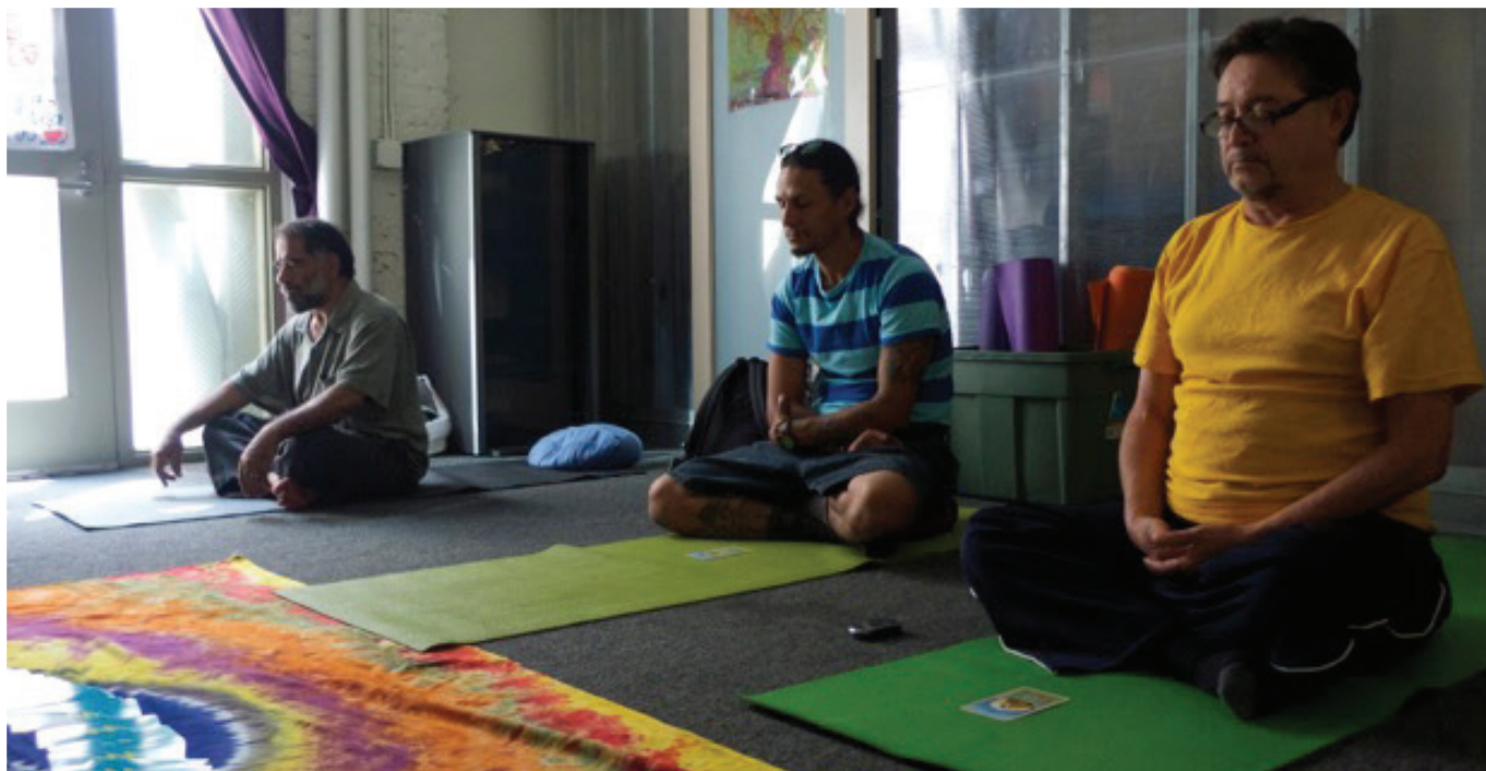
Homeless Health Care Los Angeles offers additional holistic services like tai chi and mindful meditation alongside harm reduction strategies.

Therapists conceptualize decision making as being a 'balance sheet' of comparative potential gains and losses (Cancer