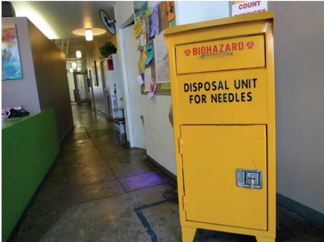
Needle disposal unit at the Center for Harm Reduction in Los Angeles.

We keep our clients safe by distributing clean injection supplies, providing disease management, and offering education that focuses on overdose prevention/reversal with naloxone and safer injecting techniques.