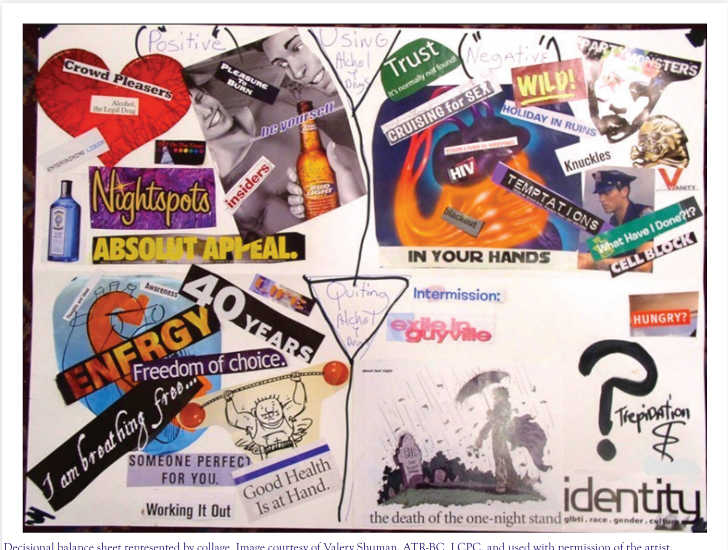
Decisional balance sheet represented by collage. Image courtesy of Valery Shuman, ATR-BC, LCPC, and used with permission of the artist.

New Mexico has the highest rate of heroin and prescription drug overdose deaths in the nation, and teen heroin use in New