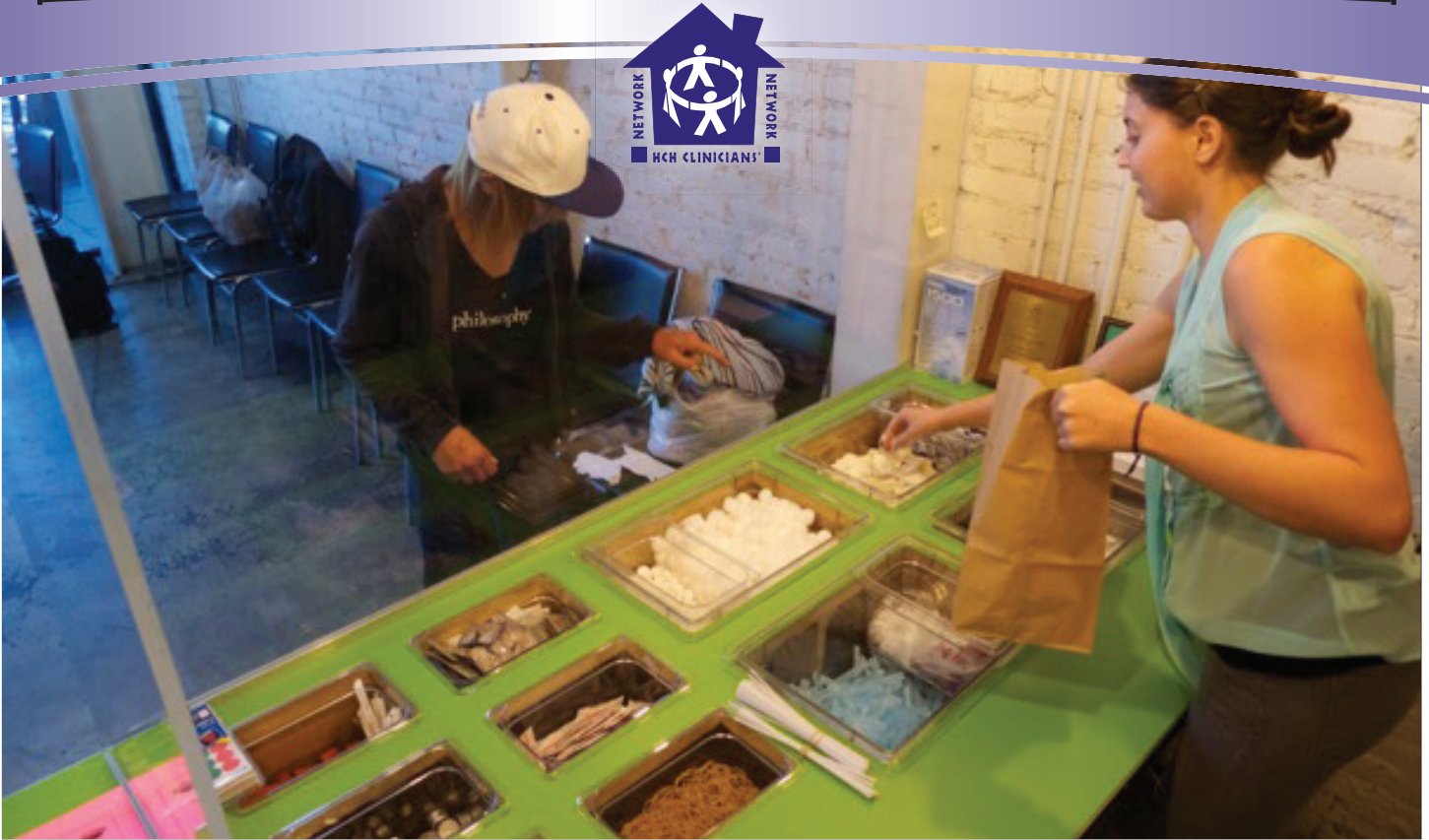
Clients access safe, clean injection supplies at the Center for Harm Reduction in Los Angeles, California.