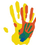
National Consumer Advisory Board