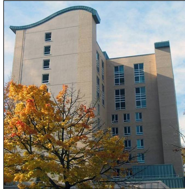
Richard L. Harris Building