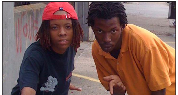
Young people at the Drop-In Center in New Orleans.

Street Youth: A youth who is indefinitely or intermittently homeless and spends significant time on the street or in other areas that increase personal risk (i.e., sexual abuse, sexual exploitation,