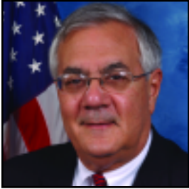
Congressman Barney Frank