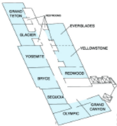
CONFERENCE LEVEL 2ND FLOOR